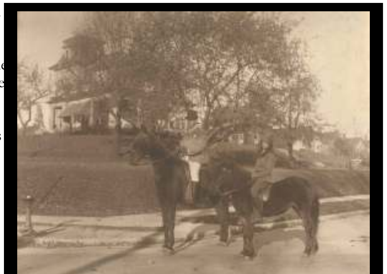
"the house on the hill", Lakeview Ave.

after the Civil War and the abolishment of slavery. More myths will be cleared up as the exhibit installation time approaches. The UGRR local interpretive exhibit has a traveling exhibit component that will