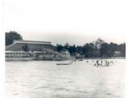
Enlargement on pg 6

in the dance hall, basketball, tennis, and croquet. These were the lively attractions of the era. Cont. on pg. 6