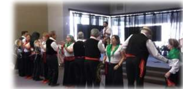
Clean up and fix up the herb garden, teach some local history by giving a Brown Bag Talk, and dancing for pizza!