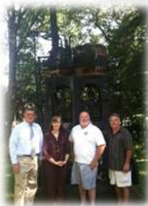
Buy and install the main stair carpet runner, pay to have the Ahlstrom piano moved and changing the beams supporting the City of Jamestown engine.