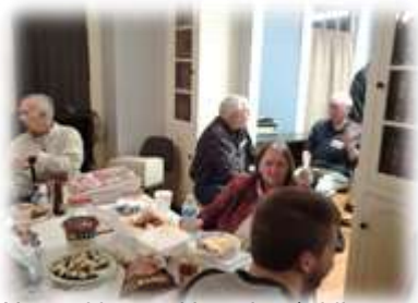
Networking and learning (while snacking) during the library lock-in.