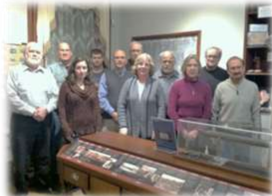
2015 Board of Trustees