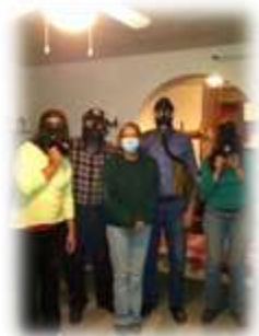
DEDICATED volunteers help clean up the basement after a sewer pipe replacement!